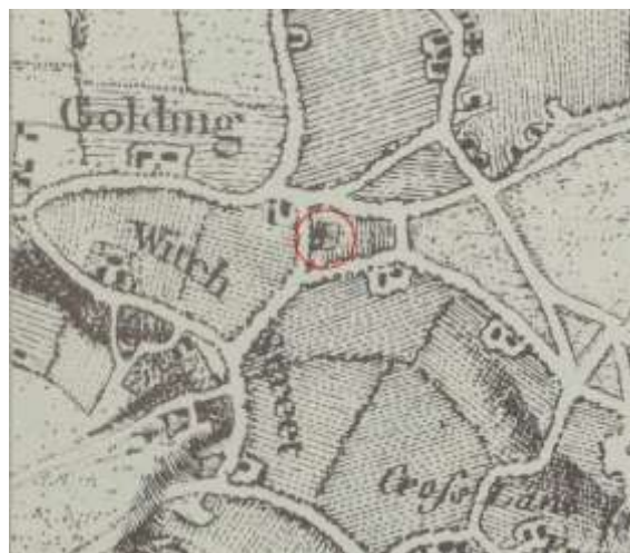
Figure 1. John Rocque's 1768 map

Whytstreet Farm also appears on John Rocque's 1768 map of Surrey (right, circled). The building shown is not named on either map.