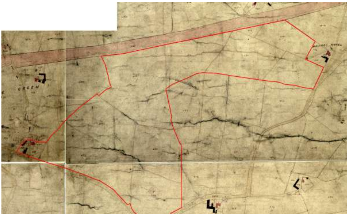
Figure 2. 1840 Woking tithe map